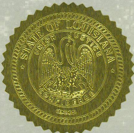
John Bel Edwards Governor

IN WITNESS WHEREOF, I have hereunto set my hand officially and caused to be affixed the Great Seal of the State of Louisiana, at the Capitol, in the City of Baton Rouge, on this 22nd day of May A. D., 2023.