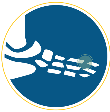
The most common form of inflammatory arthritis