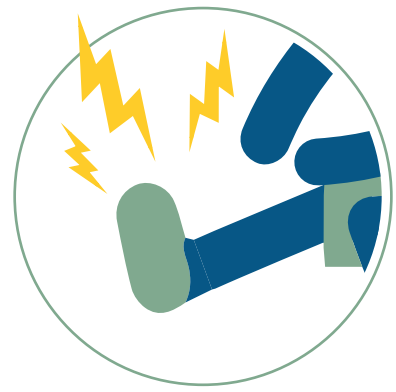
Experienced as excruciating attacks