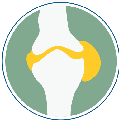
Caused by uric acid build-up in the joints